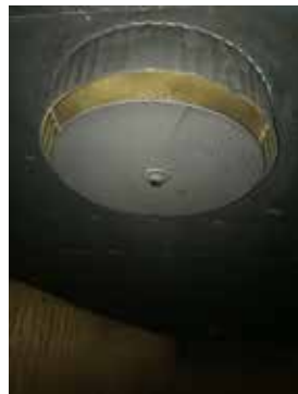
ORIGINAL LIGHT FIXTURE