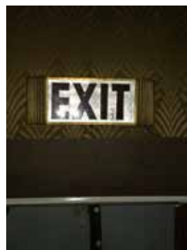
ORIGINAL EXIT SIGN