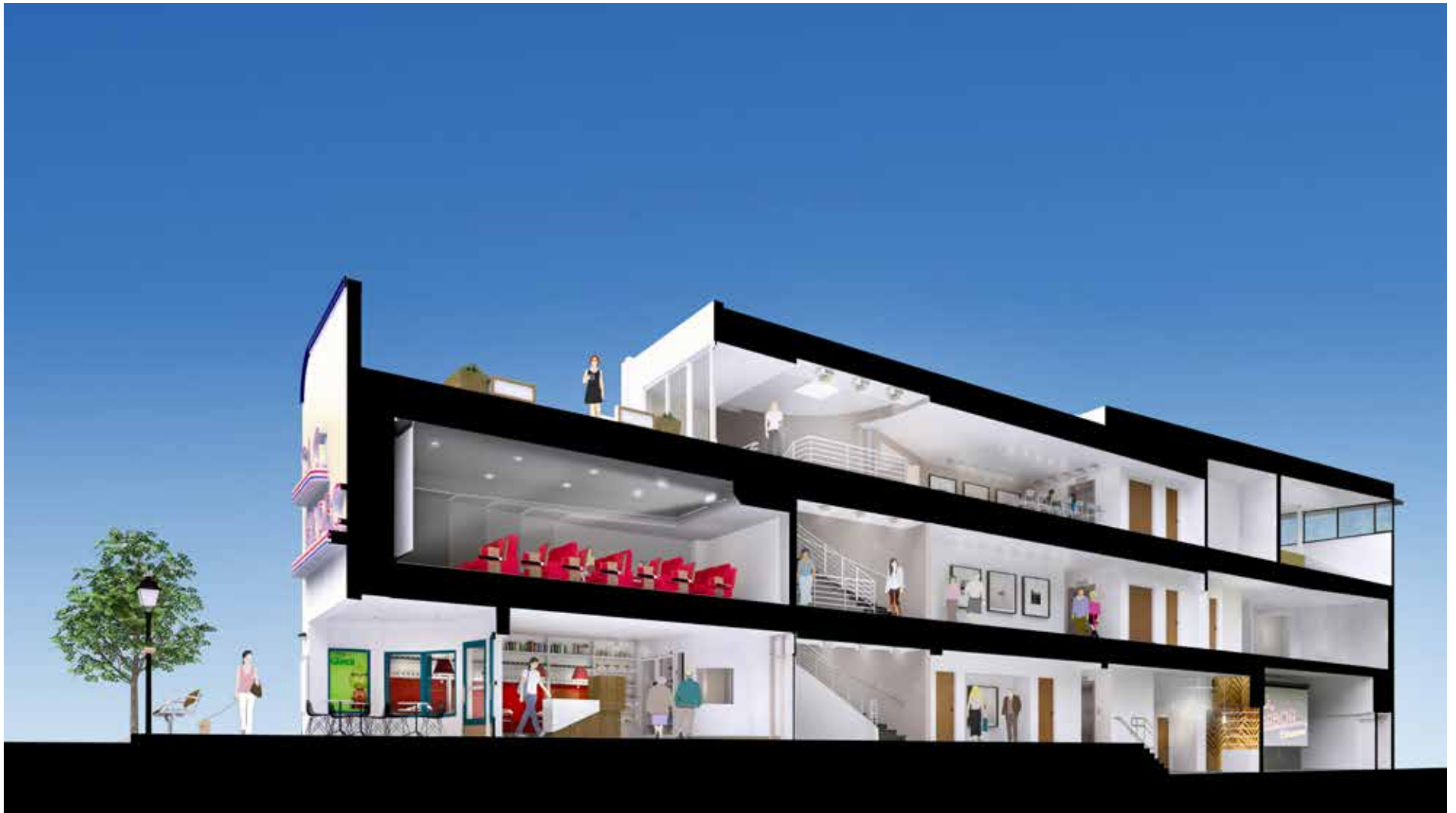
Interior cutaway elevation view of the new Sag Harbor Cinema by Allen Kopelson of NK Architects