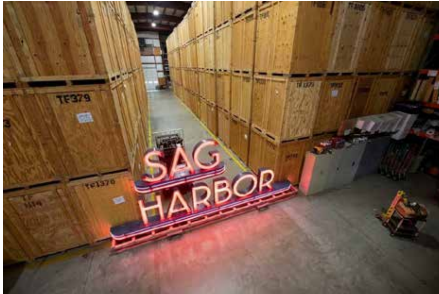
RESTORED CINEMA SIGNAGE